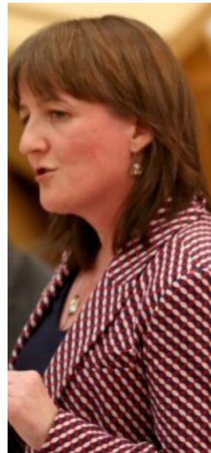
Scotland's Public and Women's Health Minister Maree Todd

Unlike Scotland, Ireland does not automatically remove anyone from the CervicalCheck cervical screening register. We continue to invite people for screening post-hysterectomy, unless we receive confirmation from the participant, in consultation with their GP or hospital doctor, that screening is not required.